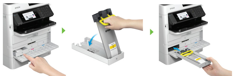
Designed for easy replacement of ink packs

Enjoy greater cost-savings with these high-volume ink packs