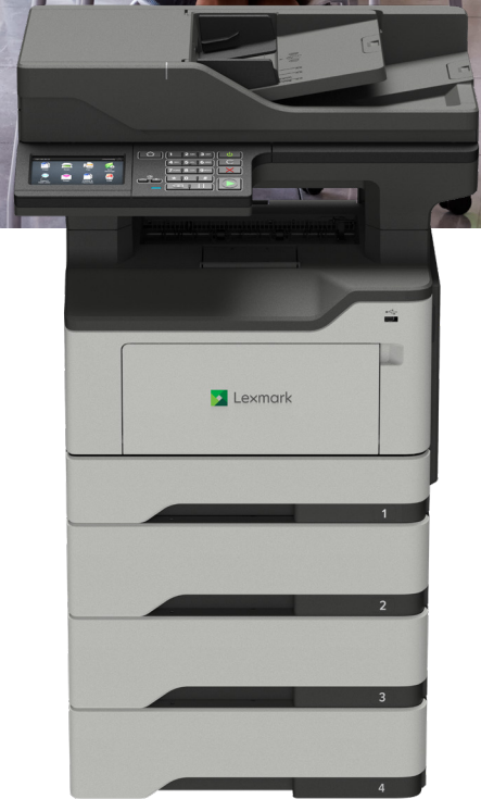
MX522adhe with optional trays